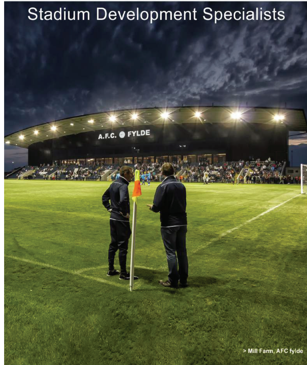
> Mill Farm, AFC fylde

architecture • project management • structural engineering • interior design building surveying • m&e design • quantity surveying • cdm consultancy